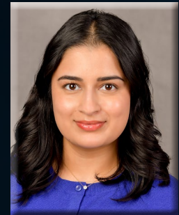
Veronica Singh College of Graduate Studies