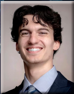
Zachary Williams College of Medicine