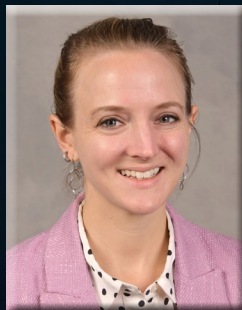
Elizabeth Cerroni College of Nursing