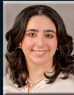
Estelle Khairallah College of Medicine