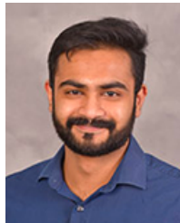
Akshay Dec. 14

“The BET degrader ZBC260 suppresses stemness and tumorigenesis and promotes differentiation in triple-negative breast cancer by disrupting inflammatory signaling” in the journal Breast Cancer