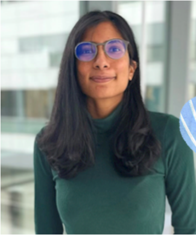
Saisha July 21