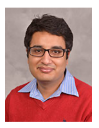
HJ Thursday, February 27, 2025 10:00 AM