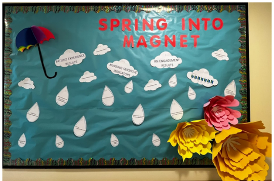
UNIT: 550 UROLOGY

"NURSING IS AN ART. IT IS ONE OF THE FINE ARTS: I HAD ALMOST SAID, THE FINEST OF FINE ARTS." -FLORENCE NIGHTINGALE