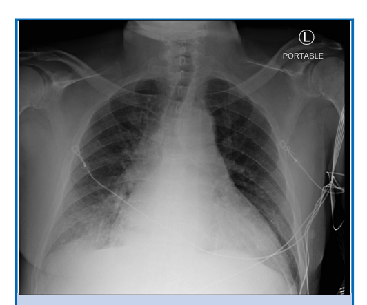
FIGURE 1. Case 1: Initial chest x-ray with cardiomegaly, pulmonary venous congestion, and Kerley B lines suggestive of acute heart failure.

records showed that the patient had a random, nonfasting thiamine level of 12 nmol/L (normal: 8 to 30 nmol/L) a few days after his initial admission.