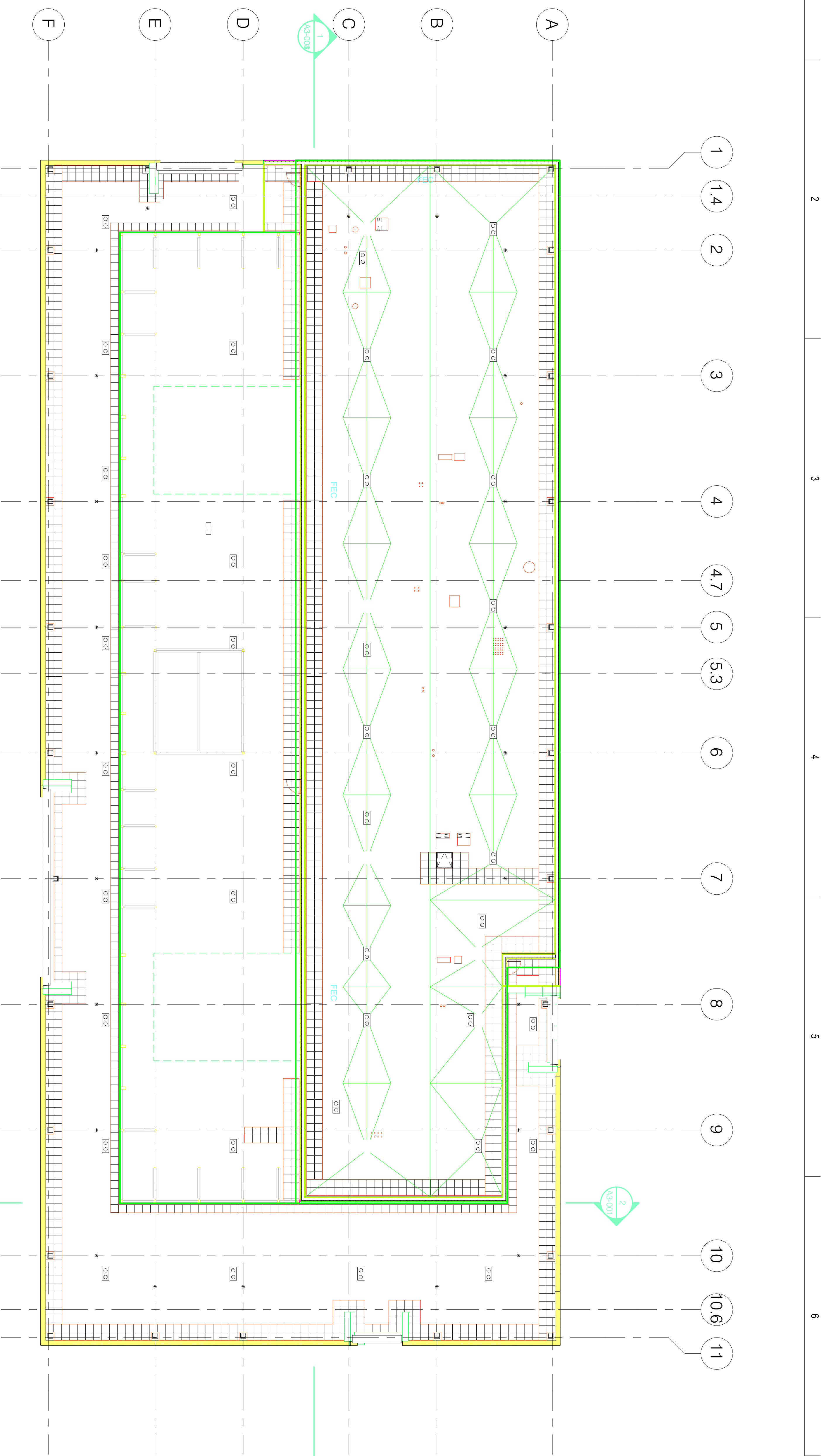
2 PENTHOUSE ROOF COMPOSITE PLAN 1/16" = 1'-0"