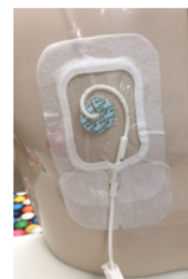
Central Line Dressings